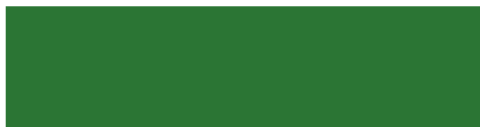
Grass Green RAL 6010